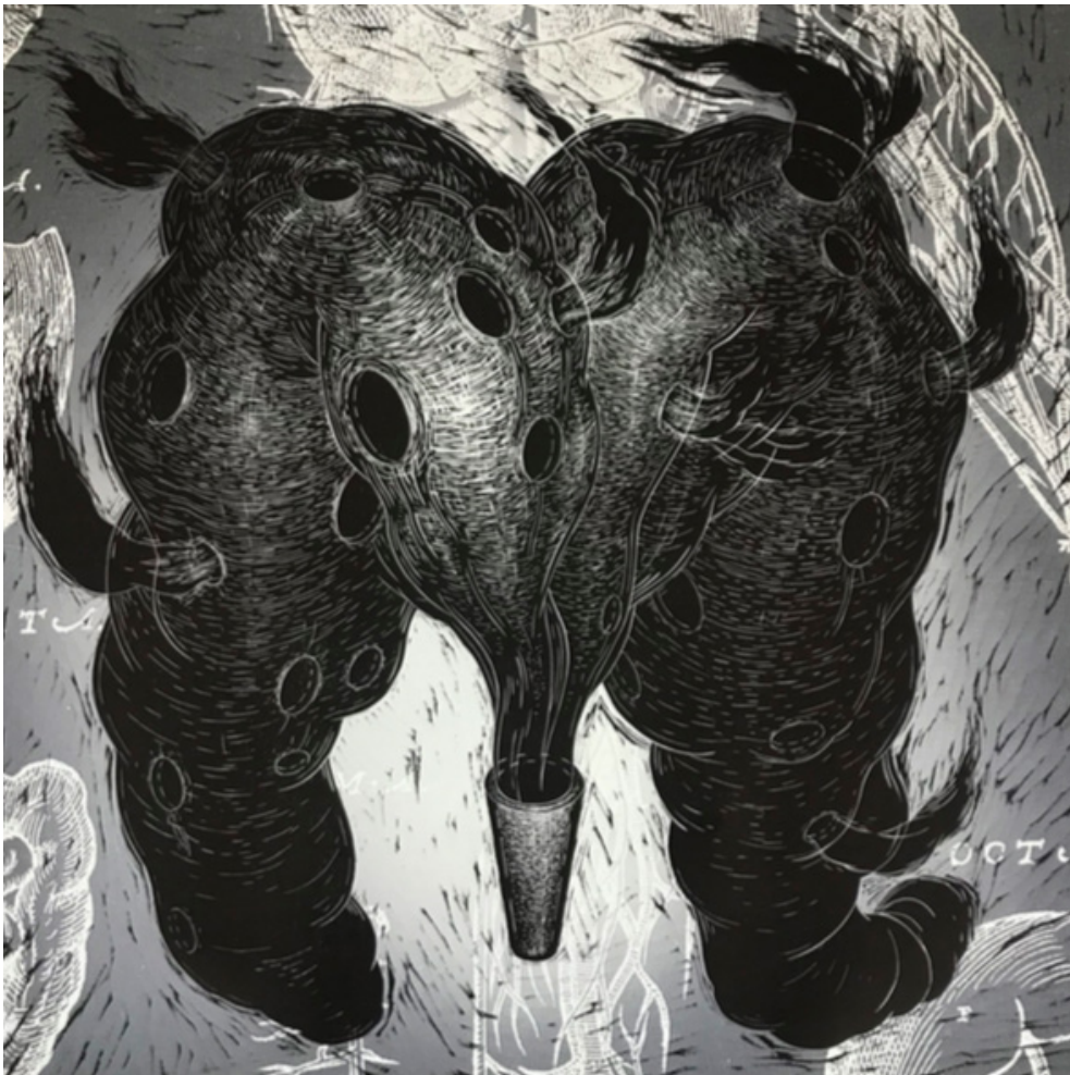
Sean Caulfield Untitled print from artist's book Infodemic Relief and inkjet, 58 x 58cm, 2020

Public health authorities should, for example, be honest and clear about the state of the science used to inform recommendations (Leask 2020; Mello, Greene and Sharfstein 2020; Robinson 2020). This includes “being transparent and open about what is known and unknown about SARS-CoV-2 virus and COVID-19 disease” (Pak and Adegboye 2020). Unsupportable or oversimplified dogmatic pronouncements of benefit or harm—no matter how noble the justification—only help to feed a polarization process that, long-term, seems likely to do real damage to public trust and the perception of science and scientists. Attention must also be paid to the mode of communication—visual media are distinct from print sources, necessitating spokespeople,