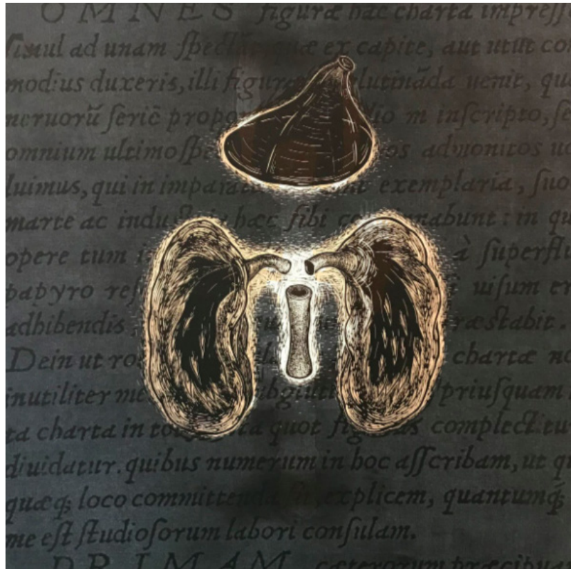
Sean Caulfield Distancing Relief and inkjet on rag, 58 x 58cm, 2020

from prominent individuals like Elon Musk and Donald Trump. This drove up public interest in the drug. Indeed, one study found that Internet searches spiked as a result of these endorsements (M. Liu et al. 2020) and, more worrisome, so did off-label prescriptions by MDs (Vaduganathan et al. 2020).